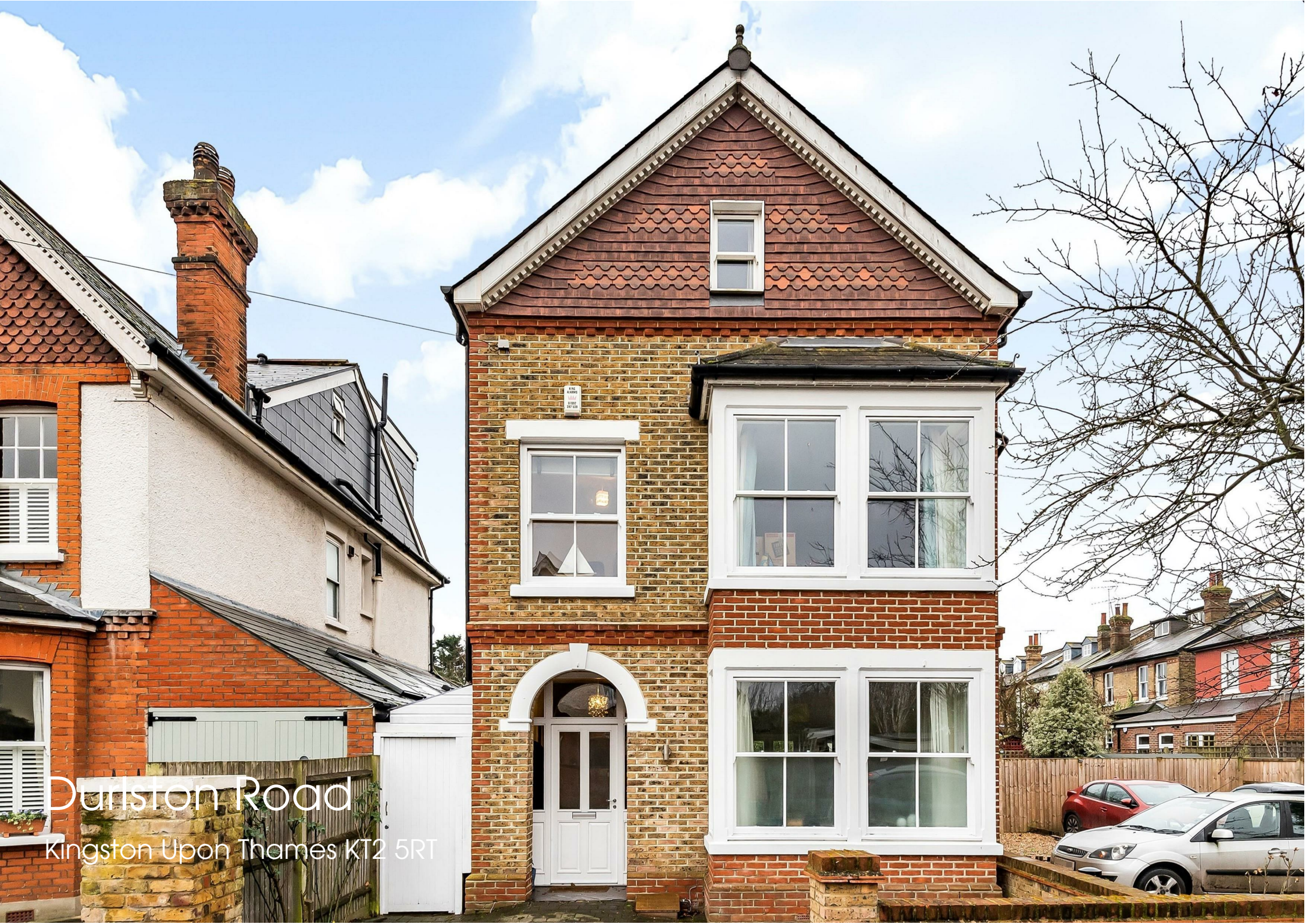
Durlston Road Kingston Upon Thames KT2 5RT